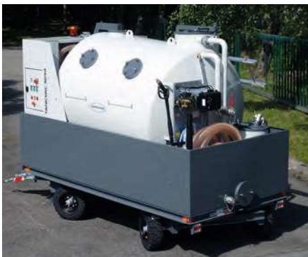
Double steering axle