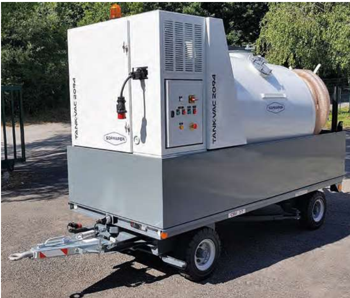
Tank Vac (1200 - 2000 - 3000 - 4000L)