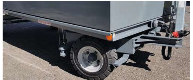
Parking brakes (with drawbar lifting)