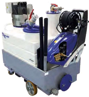
TANK-VAC SQ 450L