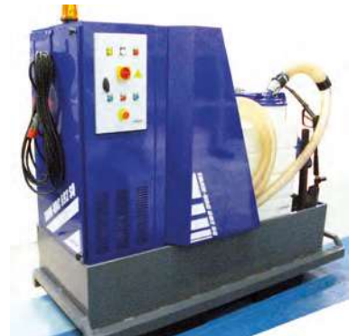
Tank Vac Skid